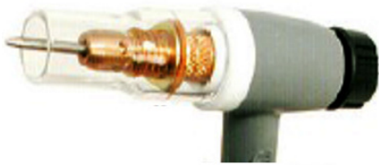
Long Quartz Nozzle fitted to WT17 with 10NQA Adaptor Ring

The Stubby Collet Body (17CB20) or a special Small Stubby Gas Lens - both used with the range of Stubby Collets - also allow use of the shorter Quartz Nozzles.