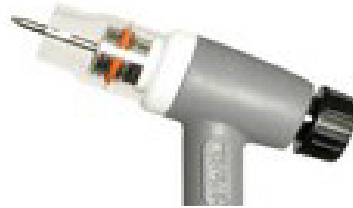
Short Quartz Nozzle fitted to WT17 with Small Stubby Gas Lens